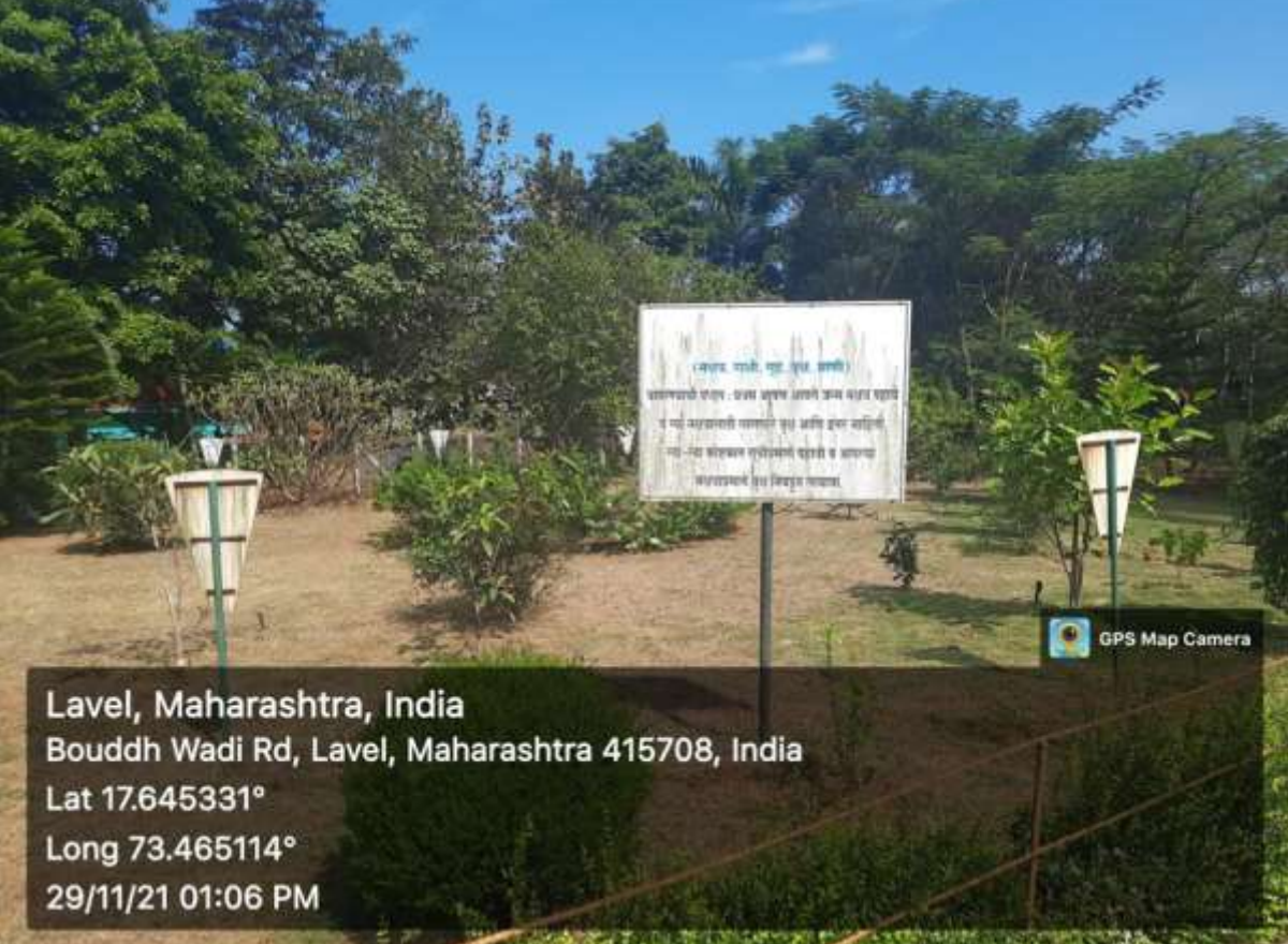
Landscaping with trees and Plants