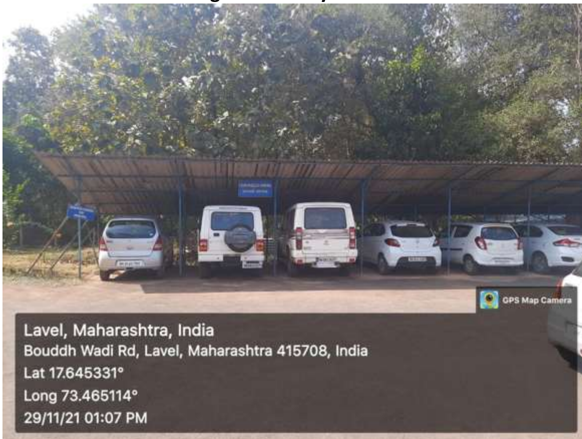
Four Wheeler Parking