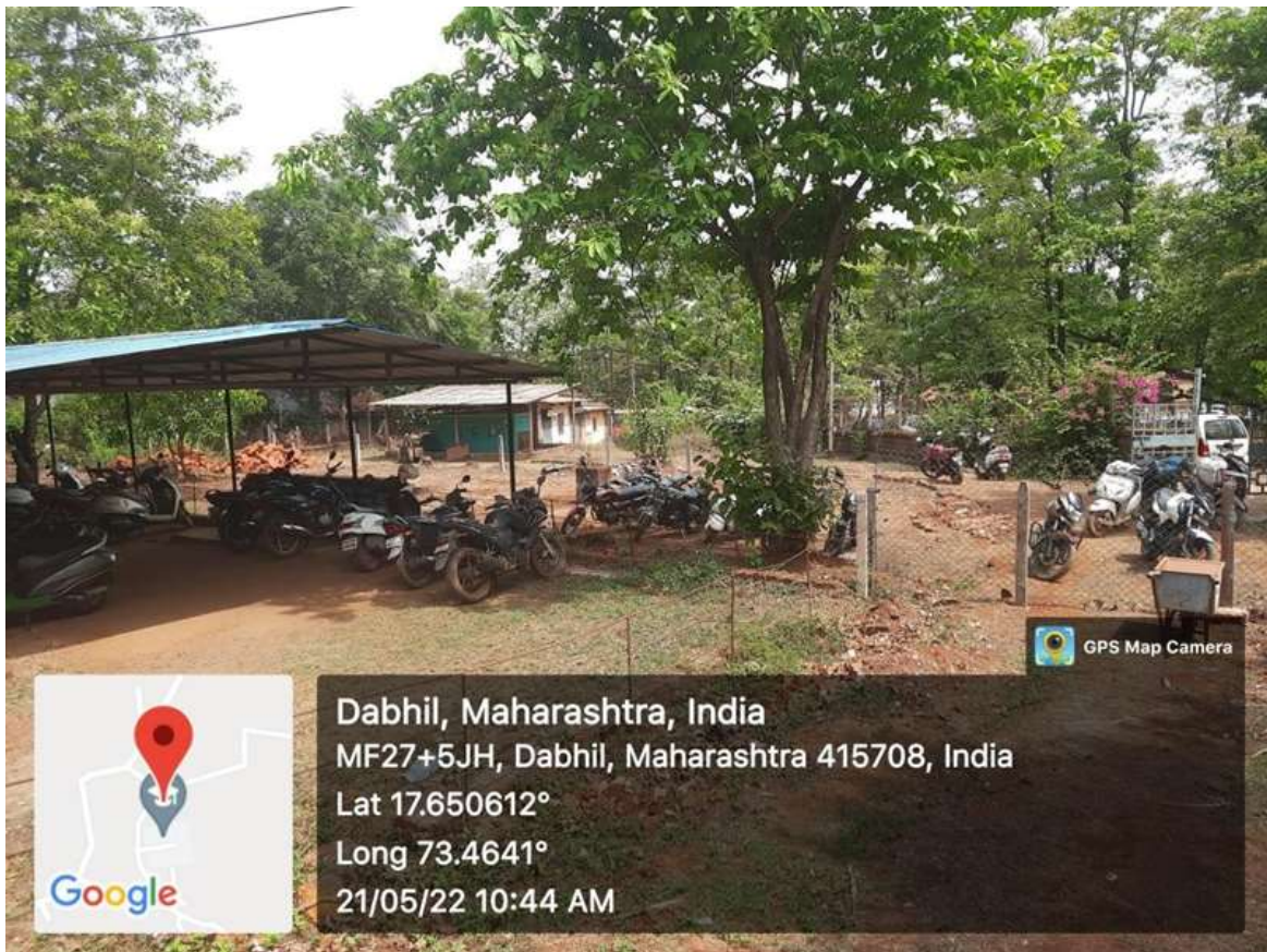
Student Vehicle Parking at the Entry Gate