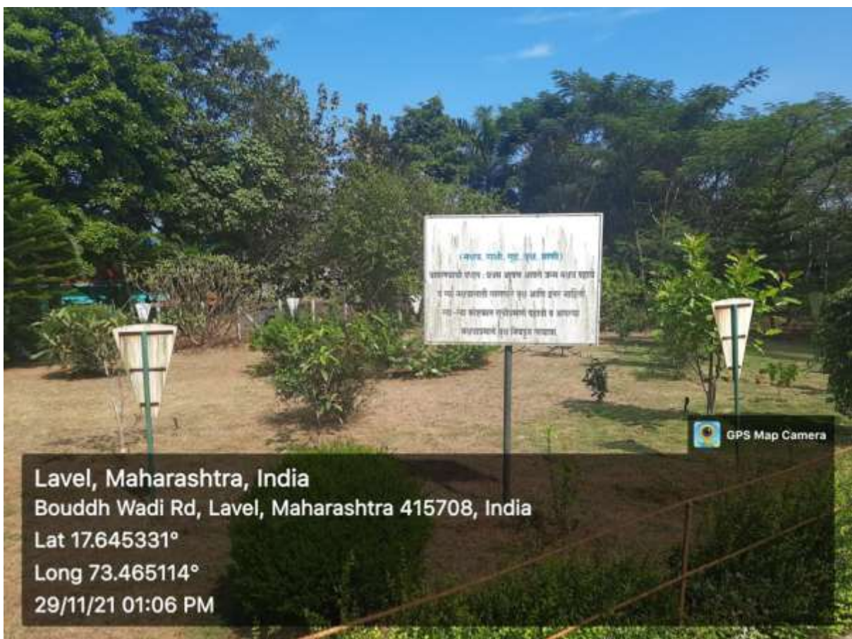
Landscaping with trees and Plants