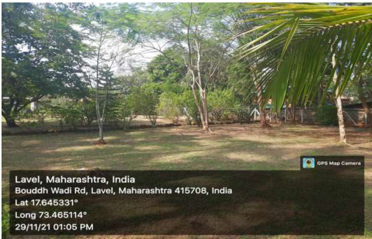
Landscaping with trees and Plants